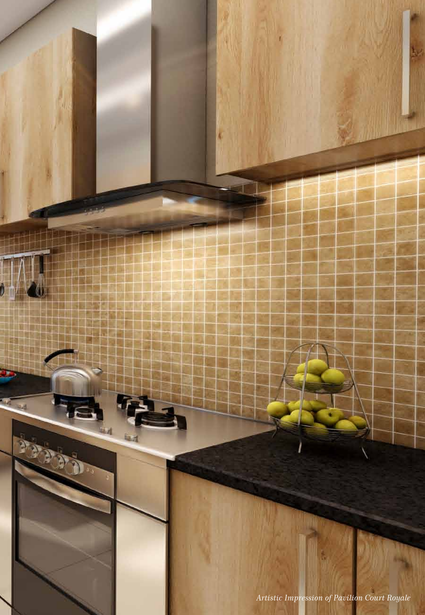
Artistic Impression of Pavilion Court Royale