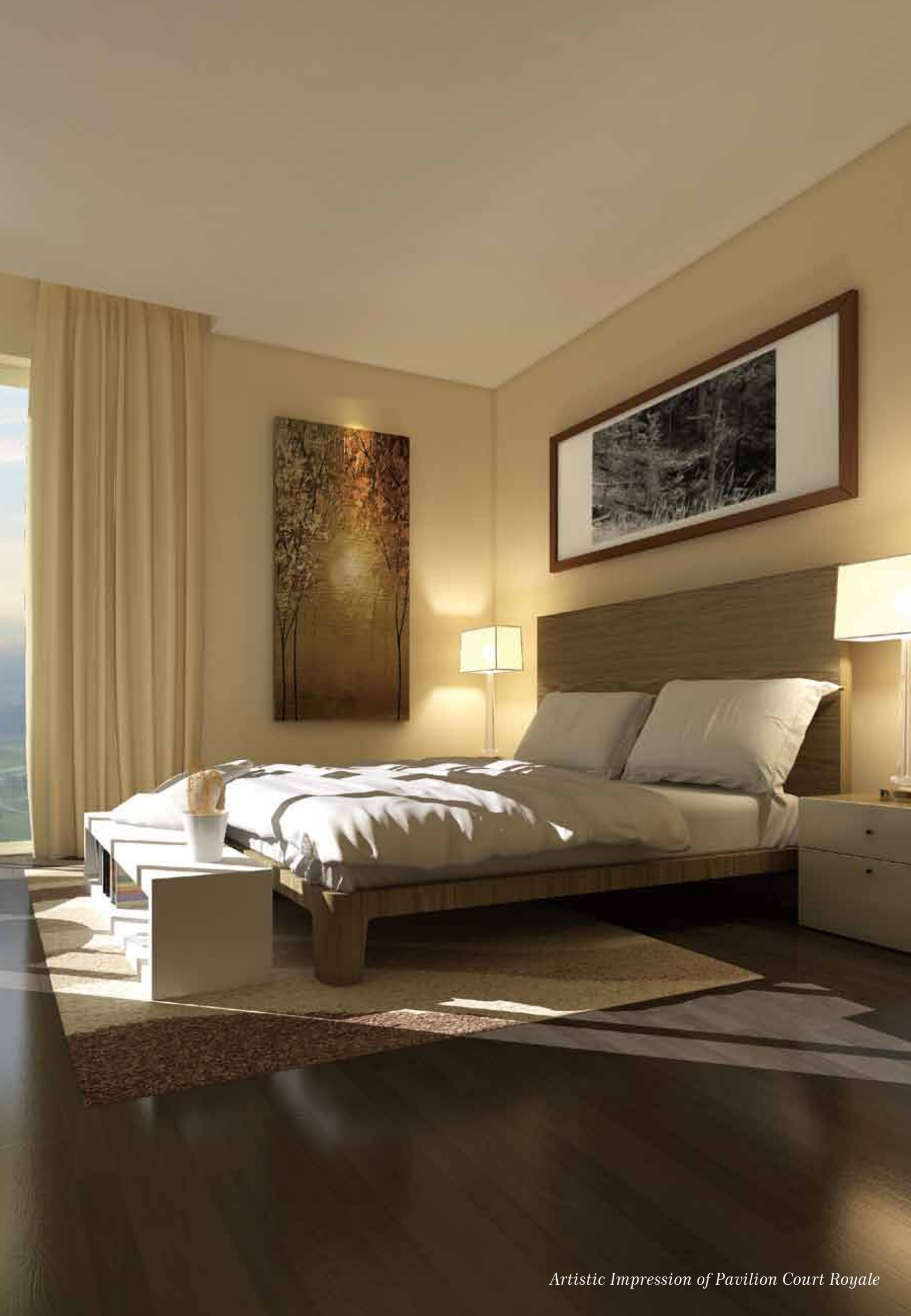
Artistic Impression of Pavilion Court Royale