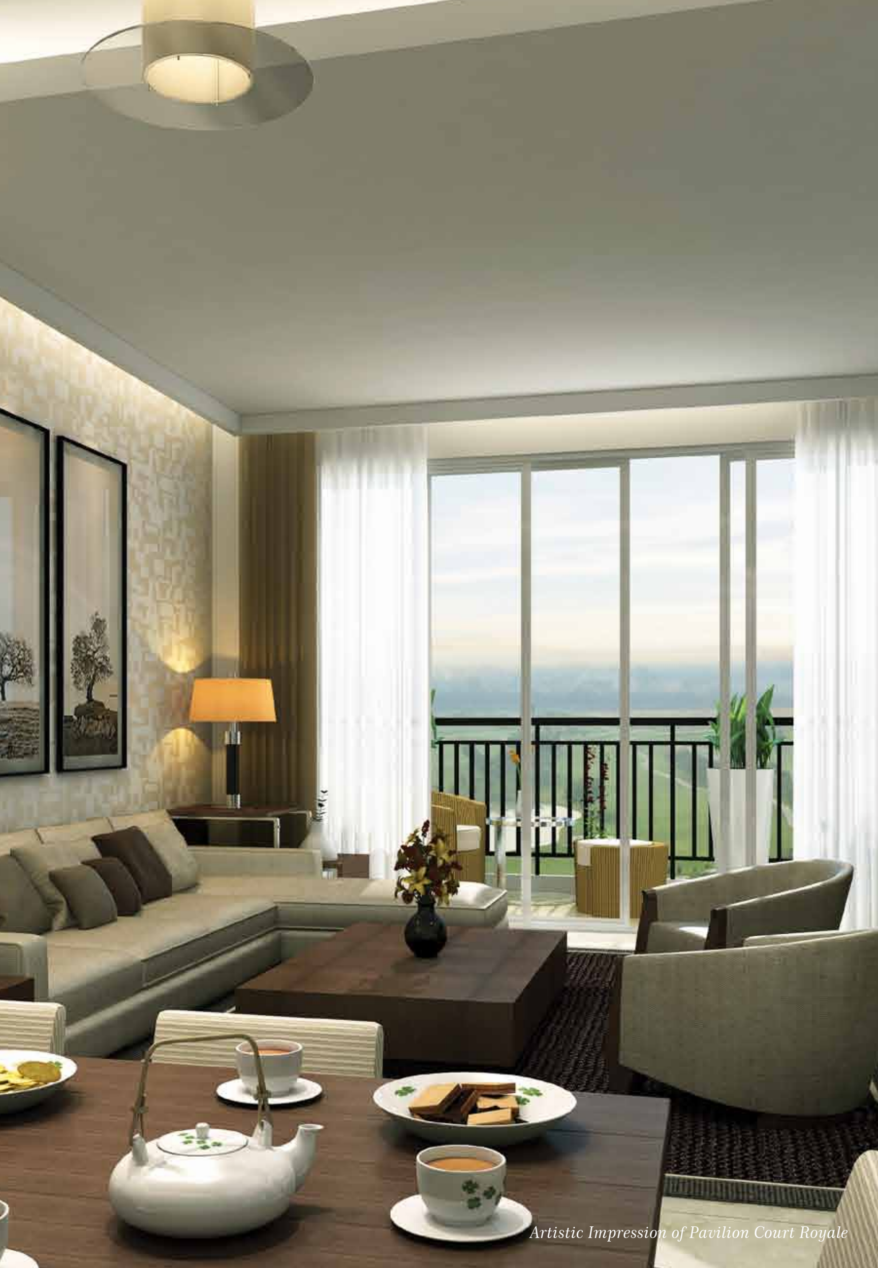
Artistic Impression of Pavilion Court Royale