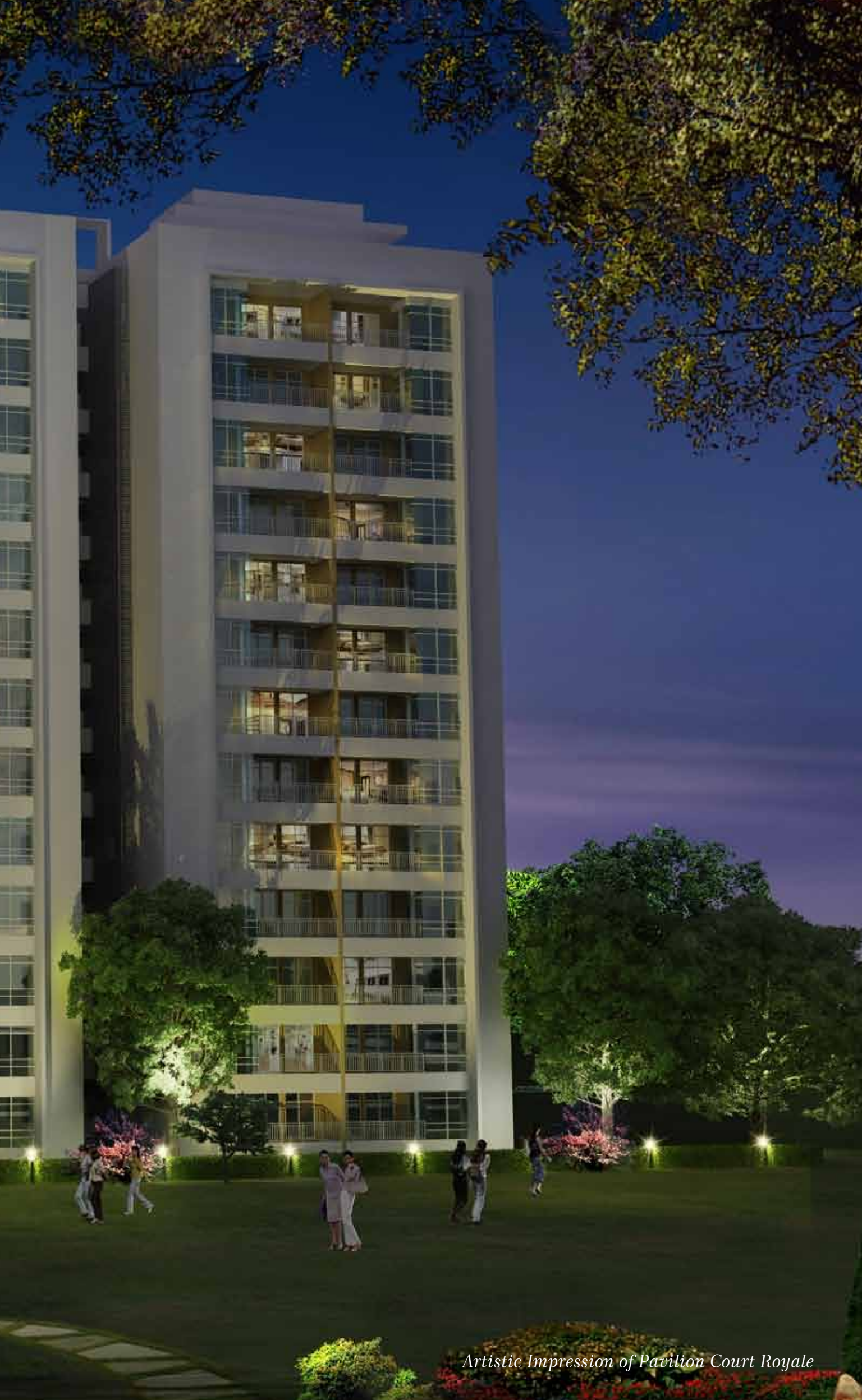
Artistic Impression of Pavilion Court Royale