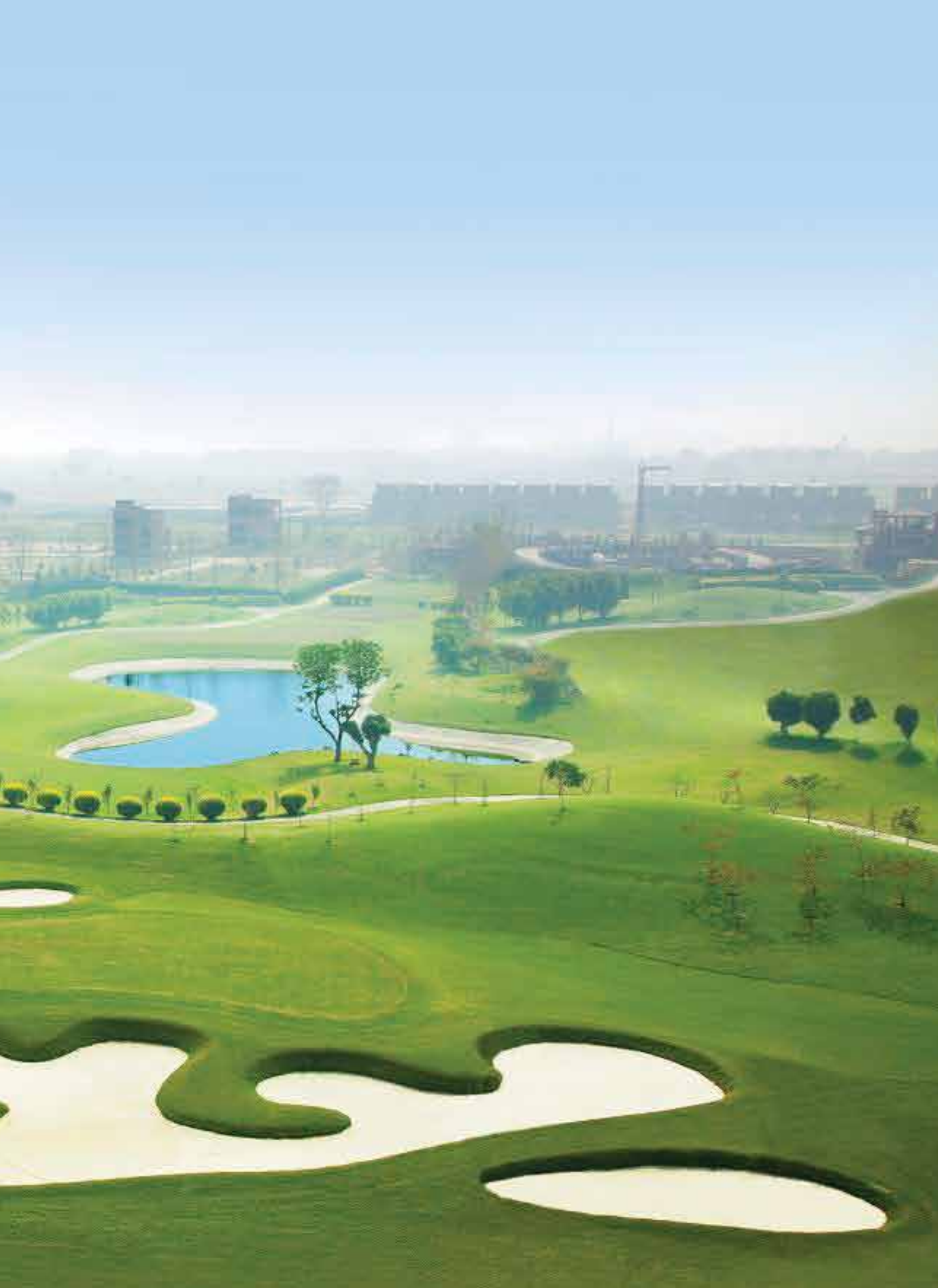
Actual View of 18 Hole Graham Cooke Signature Golf Facility