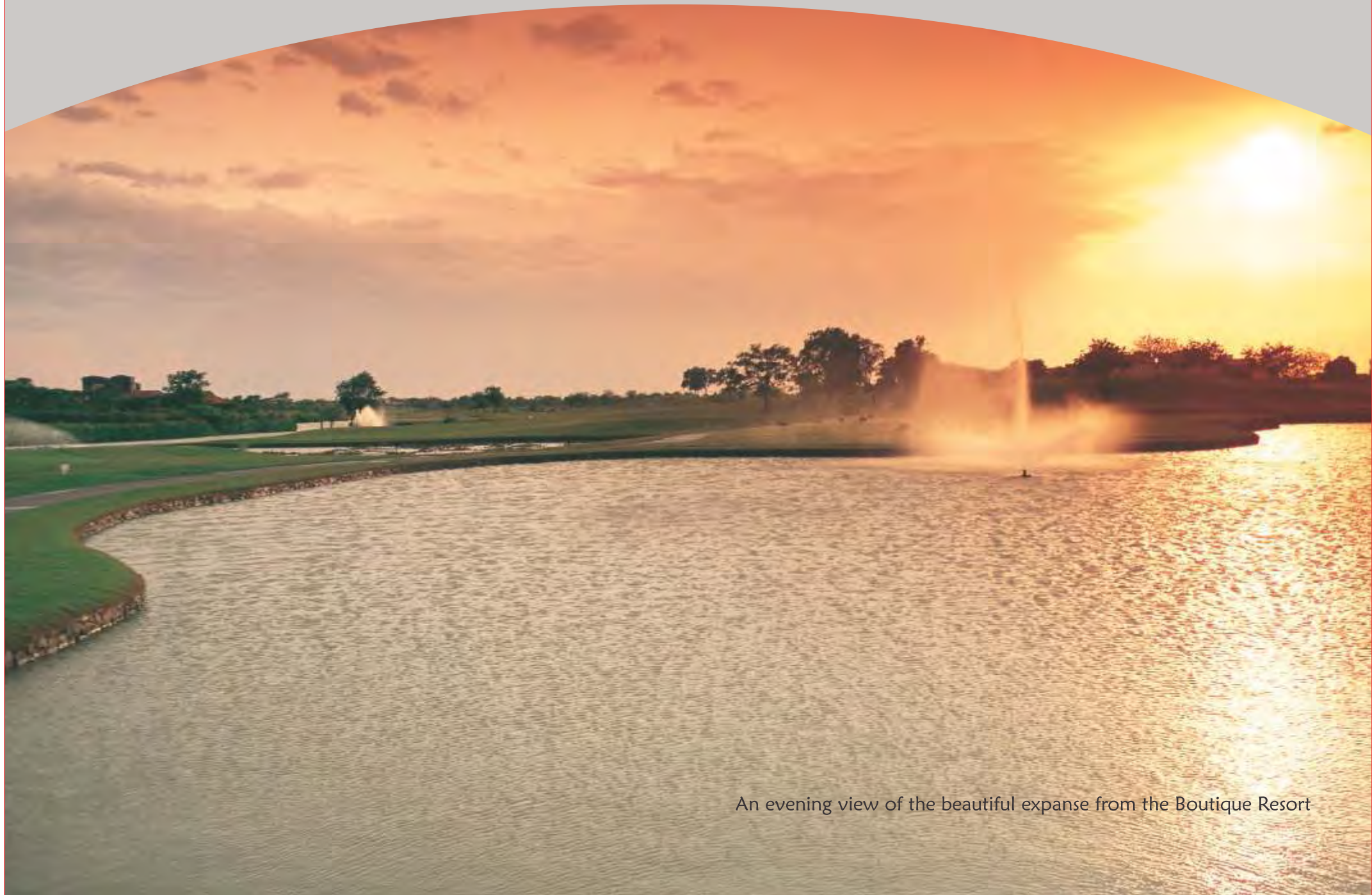
An evening view of the beautiful expanse from the Boutique Resort

Light and shadow seep through a constant reminder of life... in & around