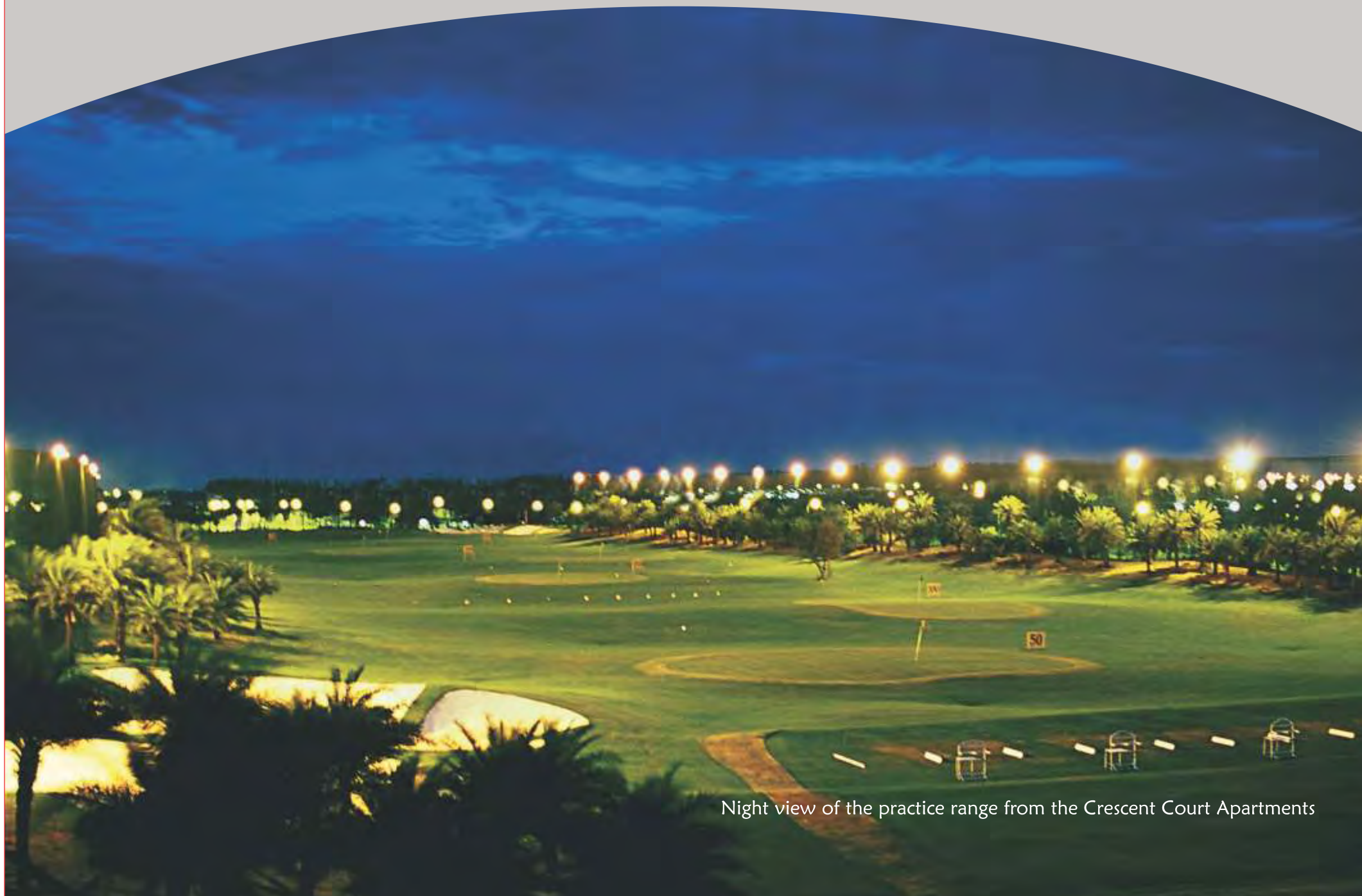
Night view of the practice range from the Crescent Court Apartments

Think not with thoughts of your mind... believe sweetness of the heart